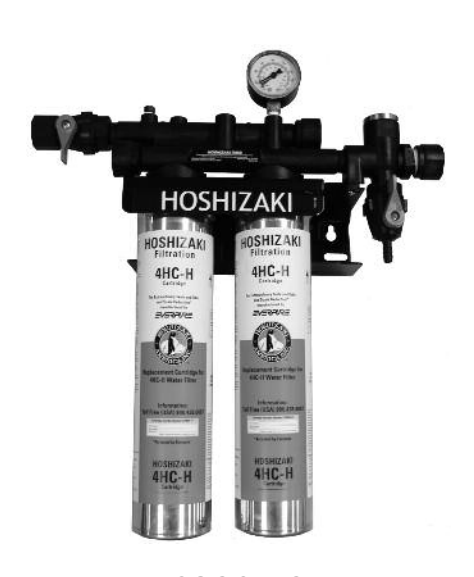
H9320-52 Twin Configuration Shown

*Available in single, twin, and triple configurations